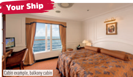
Cabin example, balcony cabin