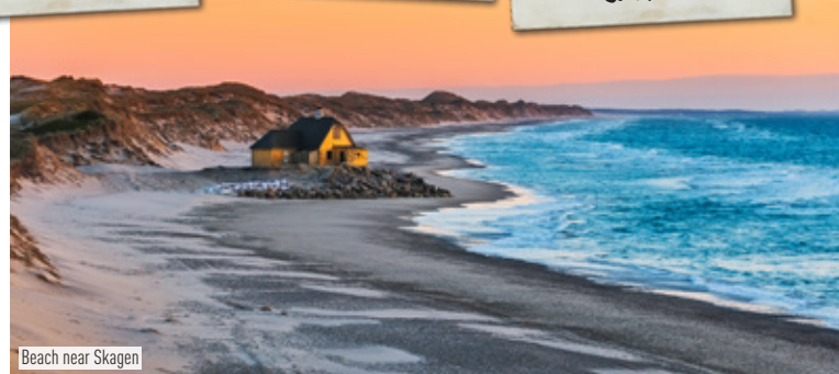
Beach near Skagen

German blues drummer legend from Berlin, 4-time German Blues Award winner (including 2023 and nominated again for 2025), your host of the cruise.